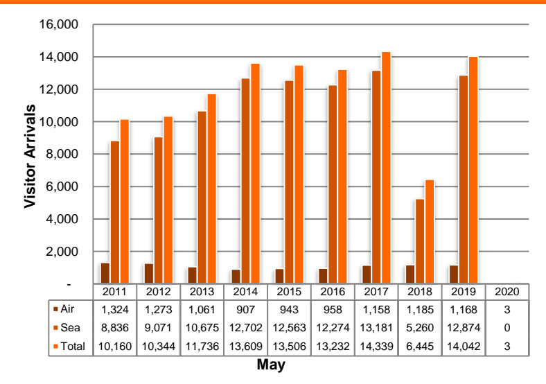
Figure 1: Visitor Arrivals: May 2011 – 2020

These three (3) visitors, were excursionists to the island whose main purpose was for business.